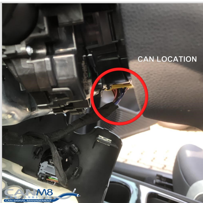
Harness containing the CAN wiring