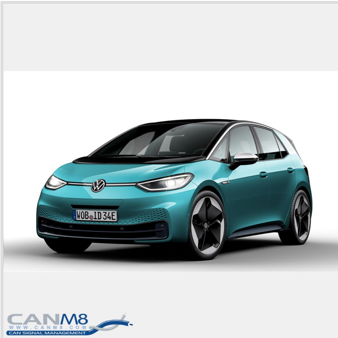
VW ID3 2021 -